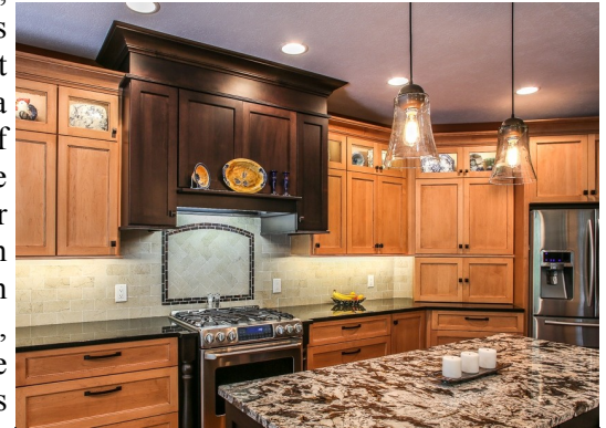
A recent kitchen design using Henry Poor Custom Cabinets.