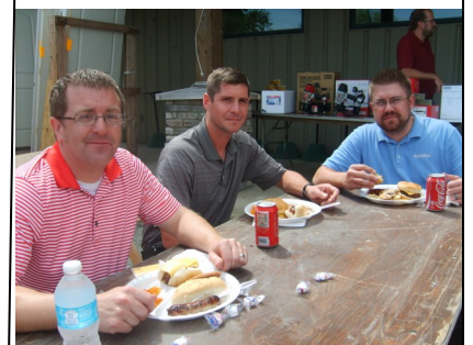
Cookout guests enjoy a great meal!